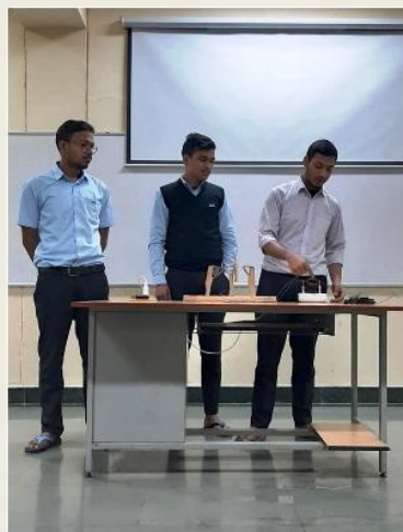
Project demonstration by MEC student in "Science Trick" competition held on January 27, 2020.