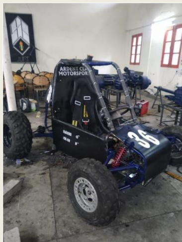
Model made by students of MEC in All Terrain Vehicle (ATV) design competition organized by SAEINDIA during March 5-8, 2020 at Chitkara University, Chandigarh.