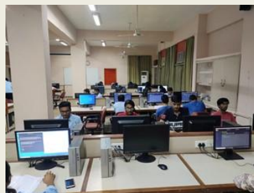
Students participating in KODEATHON A10 held on March 04, 2020.