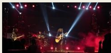
Indian Rock band from Delhi “The Local Train” performed during DEQUINOX-2020.