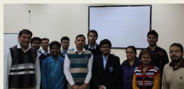
Resource Person of Fundamentals of Image Processing workshop held during February 10-12, 2020.