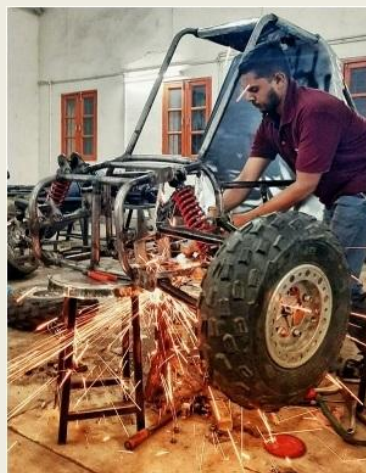
Making of All Terrain Vehicle (ATV) for M-Baja Competition organised by SAE India.