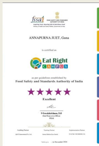
JUET Annapurna (Mess) awarded with 5 stars (Excellent) rating by FSSAI