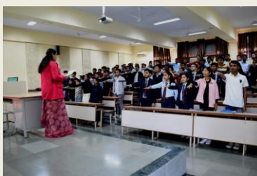
Constitution Day Celebration on November 26, 2022