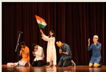
First Year Fresher's Party, October 01, 2022