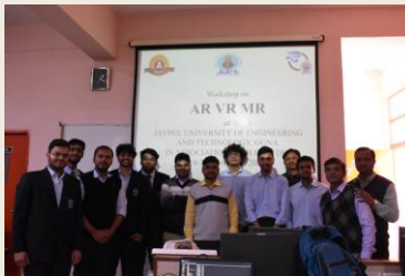
Workshop on “AR-VR- MR” during November 14-26, 2022