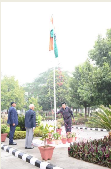
74 th Republic Day celebration