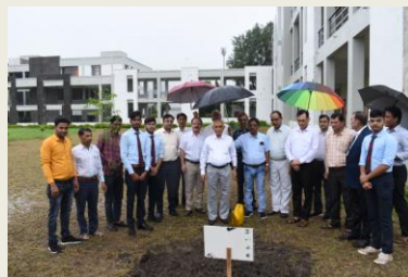
Plantation drive on ‘Azadi ka Amrit Mahotsav’