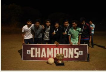
Futsal Tournament, October 12-19, 2022