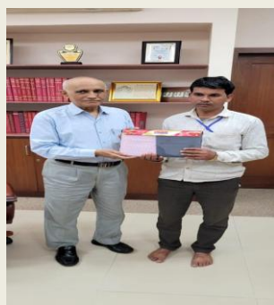
Token of appreciation to JUET Staff members for their hard work and dedication