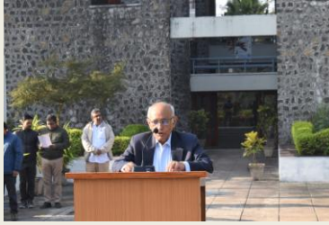
Shramik Diwas Celebration on January 2, 2023