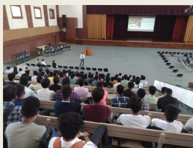
Visit of Cummins officials on September 29, 2022