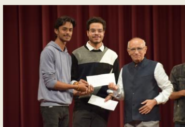
Final Year Cultural Evening, December 10, 2022