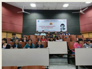
National Mathematics Day celebration during December 24-27, 2022