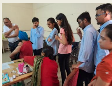
Covid-19 Booster Dose Vaccination drives at JUET, Guna on January 31, 2023