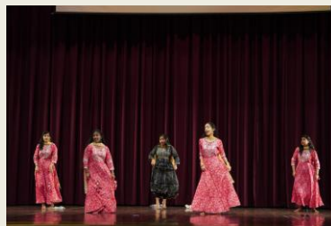
JUET Talent Hunt Show on November 27, 2022