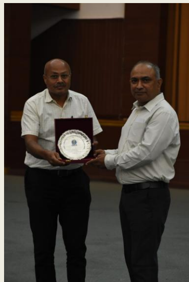
Visit of Col. Akhilesh Yadav on September 23, 2022