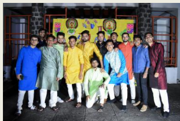
Traditional Night on November 19, 2022