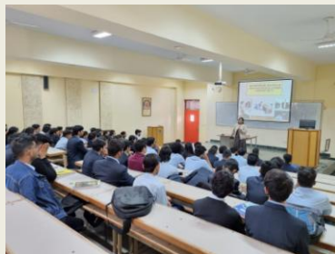
Workshop on “Entrepreneurship and Innovation as a Career Opportunity” during November 28-December 03, 2022