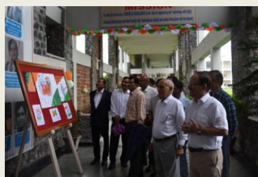
Poster making event on ‘Azadi ka Amrit Mahotsav’