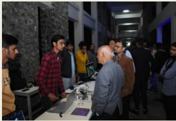
JUET Tech-Fest, January 29- 30, 2023