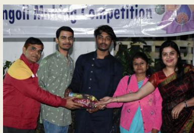
Rangoli Making Competition on theme 'Gender Equality Today for Sustainable Tomorrow', November 19, 2022