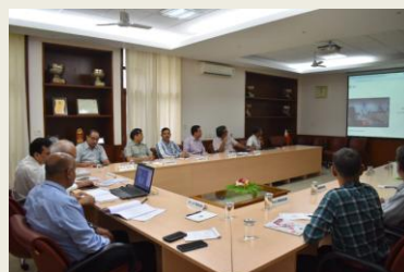
13 th Academic Council Meeting on August 26, 2022