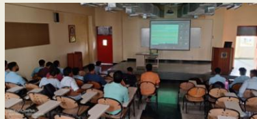
Webinar on the software “Rebarman” organized on October 08, 2022 by Civil Engineering Department