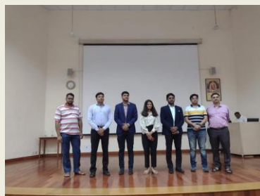
Recruitment drive by Mahindra & Mahindra on October 09, 2022