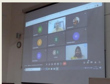
Webinar on 'Importance of Human Values and Workplace Ethics' on November 14, 2022