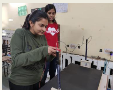
National Innovation Day celebration in JUET Guna on October 15, 2022