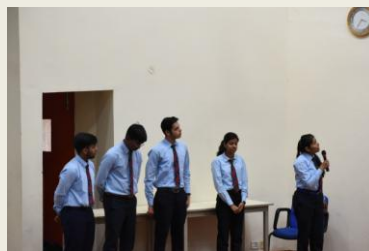
National Youth Day Celebration, January 12, 2023