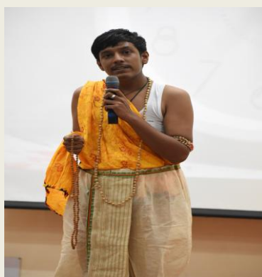
Shikshak Parv - 2022 organised during September 5-8, 2022