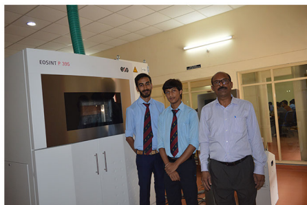
(3-D Printer installed in Additive Manufacturing Lab)

Sir, in your opinion which generation was better? When you were a student or students nowadays?